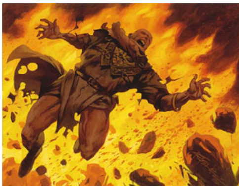
Sizzle by Christopher Moeller

The first thing Magic art has to deliver is the message that Magic is a battle of wits between two or more spell-slinging mages. In order to do this it must, from time to time, come right out and show it, as it is shown in the Story Circle illustrations done by Aleksí Briclot and Alan Pollack. It is not surprising that, of the three Story Circle illustrations, these two depict the spell being cast rather than the inspiration for the spell. Both the Briclot and Pollack illustrations were commissioned specifically for a core set. Before anything else, a core set's artistic goal is to communicate basic visual concepts of Magic —wizards are cool, smart, replete with 'tude, and devoid of purple cone hat. They have access to spells that create fire, lightning, protective fields, artifacts, and all sorts of wondrous creatures from tiny evil imps to beautiful warrior angels to terrible fire-breathing dragons. To keep the message simple and easy to digest, core sets will often leave out the extra level of detail. For example, look at the art for Sizzle . It's pretty plain to see that enemy mages can be toasted with this simple fire spell. But look at the original Sizzle below. It's a different story altogether—different in that there is story.