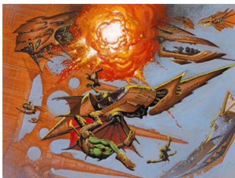
Sizzle by Brian Snoddy

In an expert-level expansion, Magic has to deliver its message on at least two different levels at the same time. (I say "at least" because I am sure there is some other secret level of which I am not aware.) In addition to continuing to deliver the "you are a powerful mage" message, expert sets must also deliver a whole new world each year, and some storyline to go with it. In order to create a panorama of a new plane, or an old one beset with devastation, a Magic set cannot rely on land and creature cards only. Characters and setting must be shown in the spell cards as well. Instead of just the spell effect showcase, we get specific locations and specific characters in the world. With Sizzle , one little 3-damage spell shows us the goblins, airships, and great air docks of Mercadia.