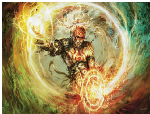
Story Circle by Aleksí Briclot

On the other hand we have Aleksí Briclot's illustration of a mage weaving a story circle spell—whirling his arms, generating mystical power, unleashing the magical stuff that will ultimately recreate the effect of the Ramosian traditional story circle.